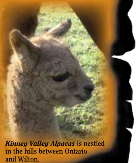
Kinney Valley Alpacas is nestled in the hills between Ontario and Wilton.

Take a leisurely auto tour and enjoy all that Monroe County has to offer.