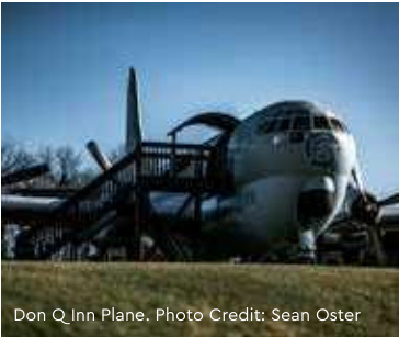
Don Q Inn Plane.