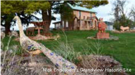
Nick Engelbert's Grandview Historic Site