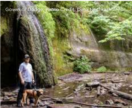
Governor Dodge.