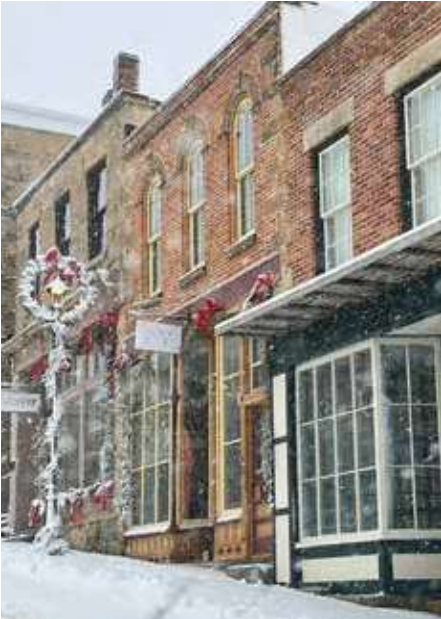
Mineral Point High Street