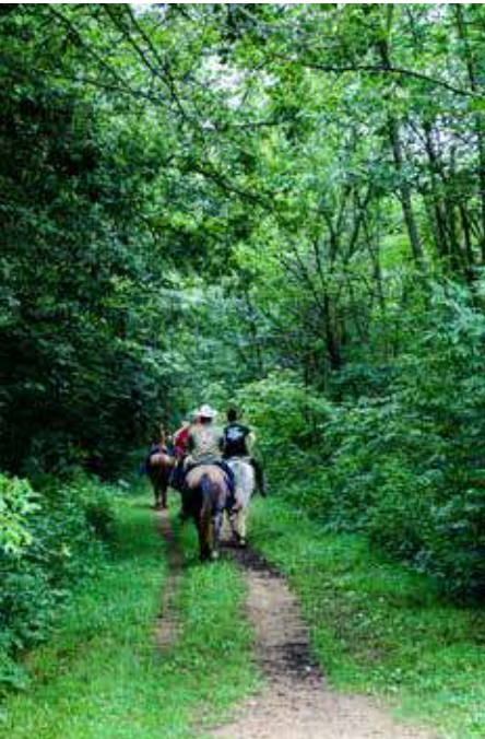
Governor Dodge.