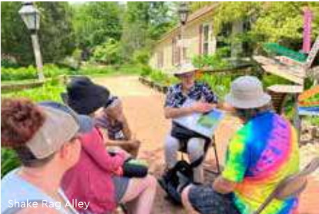
Shake Rag Alley