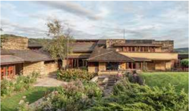
Frank Lloyd Wright's Taliesin