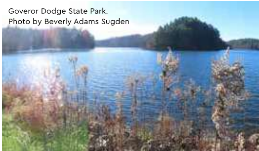
Governor Dodge State Park.